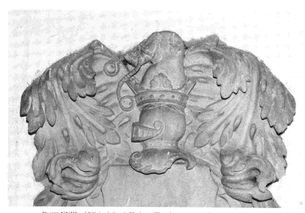
PLATE XXIII - All Saints', South Elmham: Throckmorton crest above tower staircase door.

On the floor at the west end of the nave is a large slab of buff-coloured oolitic limestone (Badham 1985, 481) with clear indents for the brass figures of a man in armour on the dexter side, inclined slightly towards a lady in a pedimental headdress; below are rectangular indents for two groups of children and two inscription plates, and by each corner was a brass shield (Fig. 59). The use of this type of stone, the outlines of the effigies and the composition in general, are features common to others of the 'Norwich style 4' series of brasses, which ran from 1505 to 1522 (Greenwood and Norris 1976, 32-34). In particular there is a resemblance to a brass at Rougham, Norfolk, dated \epsilon .1510, the outlines of the male figures being particularly close (Cotman 1839, pl.34). The stylistic evidence suggests that Blois's date of 1507 fits well with what might be expected for this slab; two other brass indents in the church are on small stones and for