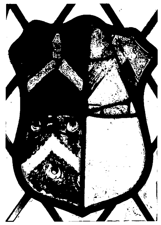
PLATE XXII - All Saints', South Elmham: south light of east window, south aisle.